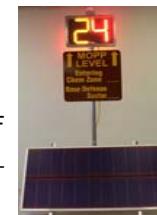
Networked UCMS systems can be customized, like this MOPP level sign.

Using state of the art microprocessor and RF devices, IST's networked products provide customers with an effective solution to more complex and wide spread control missions. Using these products puts a single operator in hundreds of locations in less time than it takes to walk out the door. Also the systems can provide field data like battery level, temperature, ambient light, signal strength, traffic conditions, speed, fault conditions and other custom inputs.